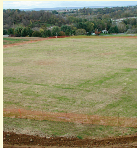
Completed soccer/multi-purpose field

On the 38 acres near the new sports complex at Wottrings Mill, there will be no development. That land remains natural open space for agricultural use and environmental enrichment. Separately, in what is known as the 40-acre Waltman tract, located off of Spring Valley Road adjacent to the landfill, there will be permanent open space. That property had been eligible for a 30-home residential development.