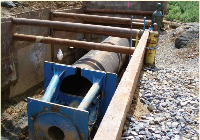
Tunnel being constructed under I-78 for conveyance of landfill gas to the generation station.

On the other hand, we are welcoming more and more visitors (recently including members of the Williams Township Landfill Advisory Committee) to the Green Energy Park project in neighboring Glendon. The official launch of the alternative energy site – powered by landfill gas from our facility – was a major success with the Pennsylvania Secretary of the Department of Environmental Protection doing the honors along with many public officials, including those from Williams Township and Glendon. Many marveled at the engineering accomplishment and the whisper-quiet hum of the generators that are turning out electricity for local consumption.